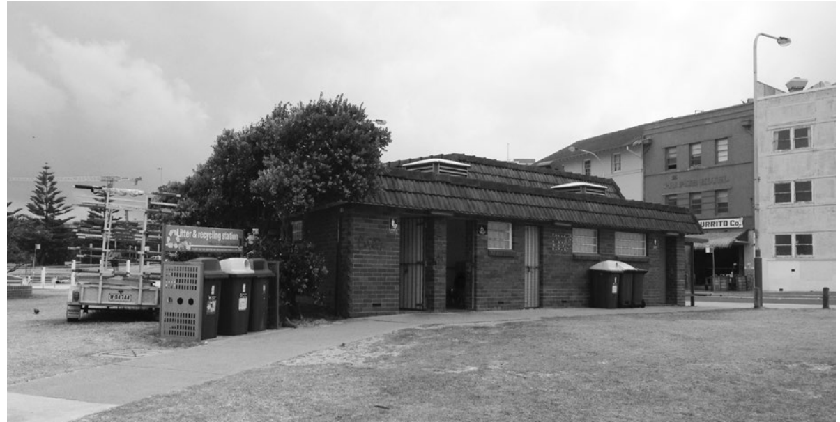
The 'brick dunny' prior to redevelopment

The architects proposed a robust concrete structure clad with recycled hardwood, and the recladding of the Pumping Station. Lymesmith was involved from early in the building design development. Designing for the harsh beach front location was a key requirement.